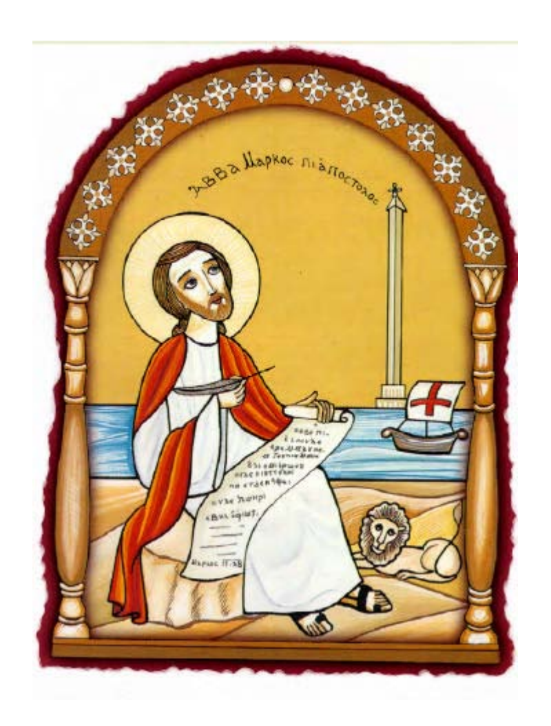
THE BEHOLDER OF GOD MARK THE EVANGELI ST SAI NT AND MARTYR