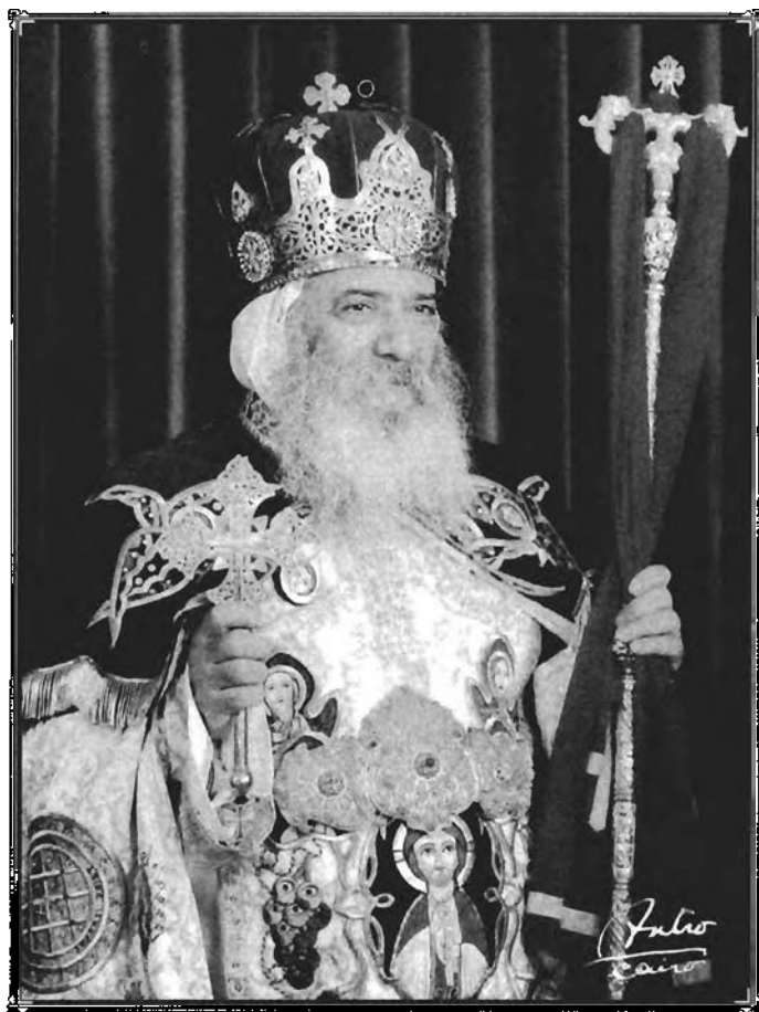
HIS HOLINESS POPE SHENOUDA III Pope of Alexandria & Patriarch of the See of St. Mark