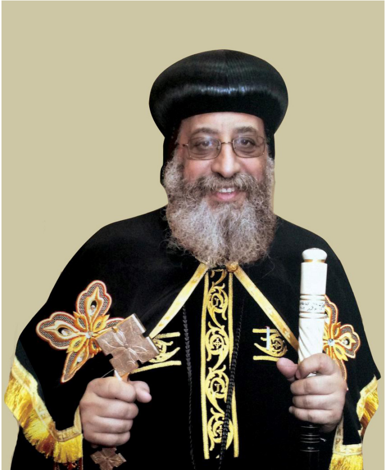
HH Pope Tawadros II