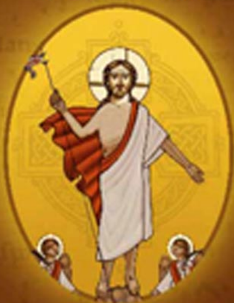
Illustration of the Resurrection of Christ the Lord (EASTERN)