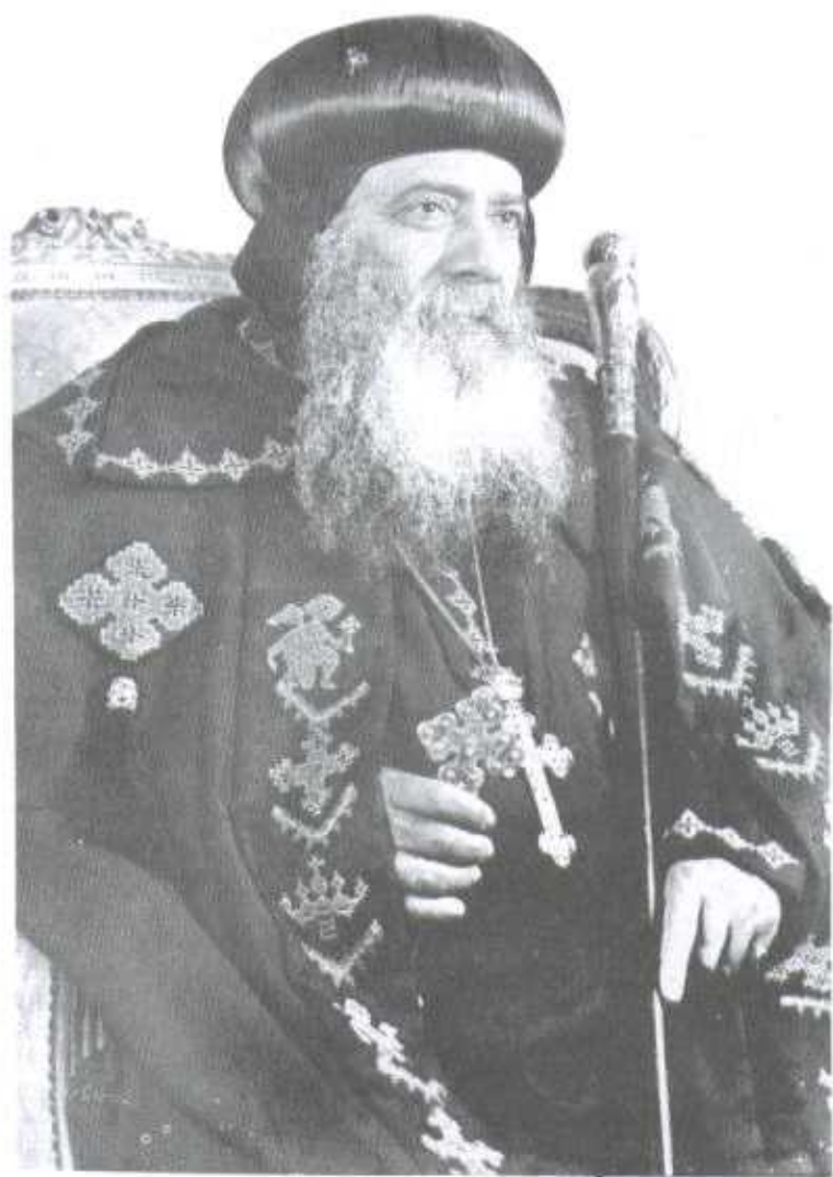
HIS HOLINESS POPE SHENOUDA III