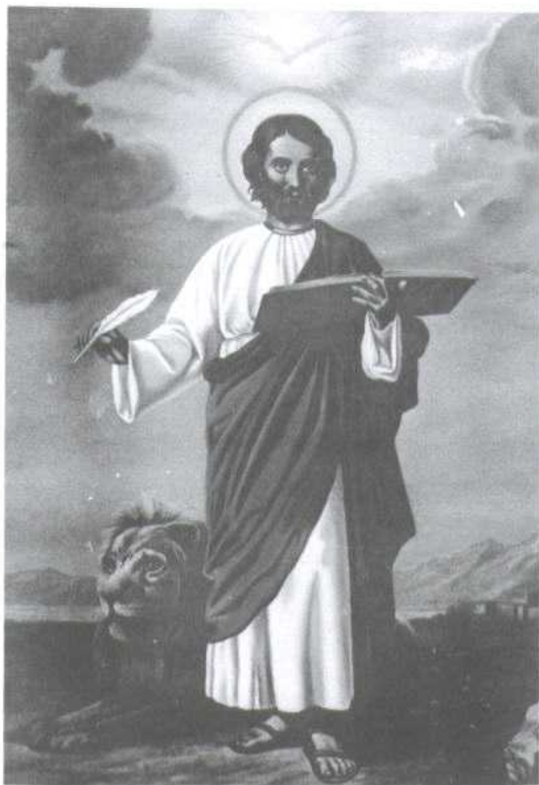
St. Mark The Apostle and Evangelist